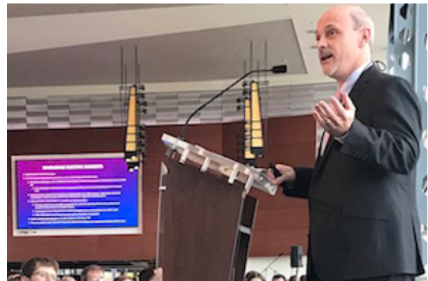
Keynote address at the 2017 ANS Student Conference.