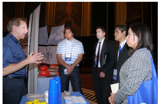
Exhibitor talking to students at the Career Fair.